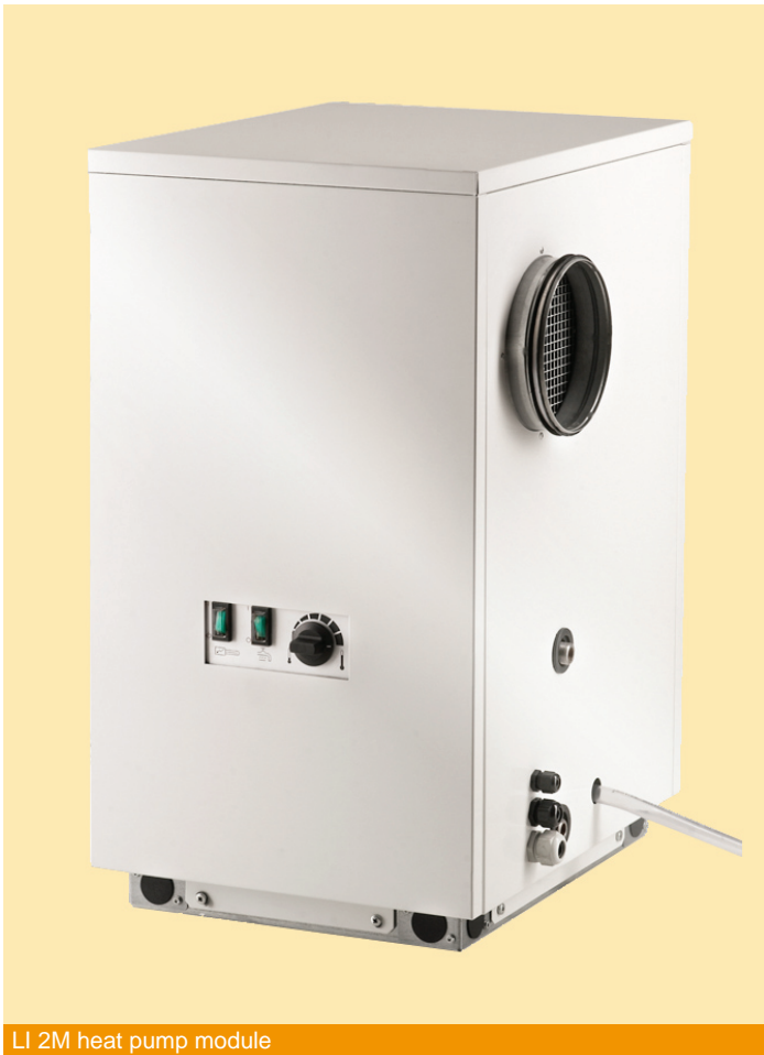
LI 2M heat pump module