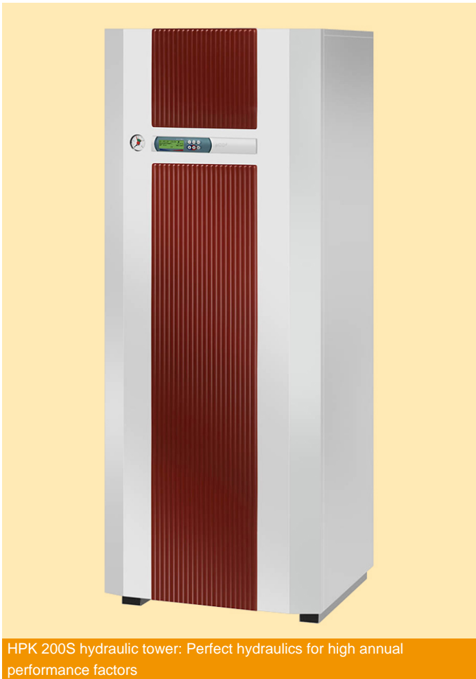
HPK 200S hydraulic tower: Perfect hydraulics for high annual performance factors