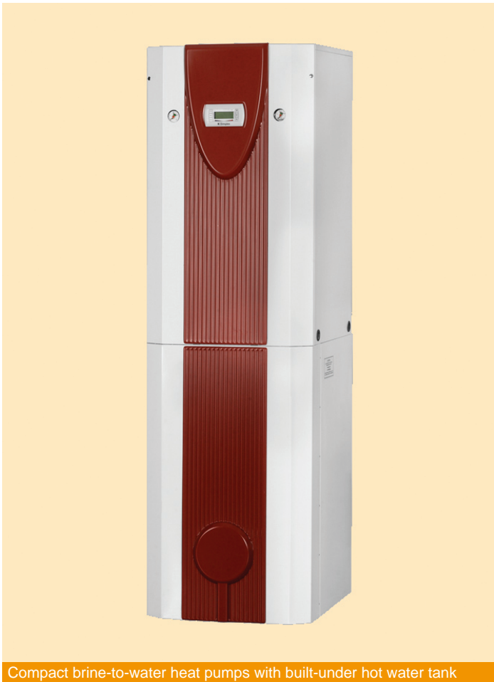
Compact brine-to-water heat pumps with built-under hot water tank